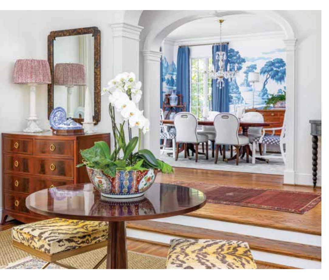
When it came to the entrance into the living room, Caroline took a symmetrical approach to styling the space on either side of the archway. Although reproductions, the chests of drawers tie in nicely with the rest of the home's antique wood furnshings. An unobstructed view of the dining room plays up the blue-and-white accents—from the buffalo check armchairs to the chinoiserie vases.